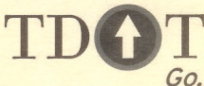
Director, Small Business Development Program